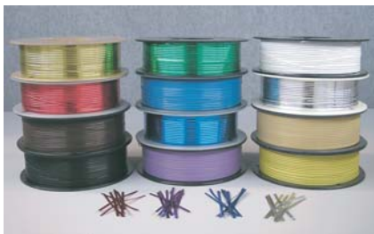
Assorted colors of twist tie spools and pre-cut ties available.